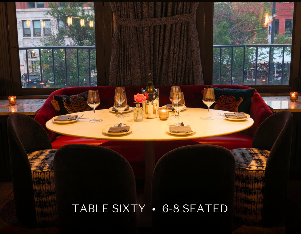
TABLE SIXTY • 6-8 SEATED