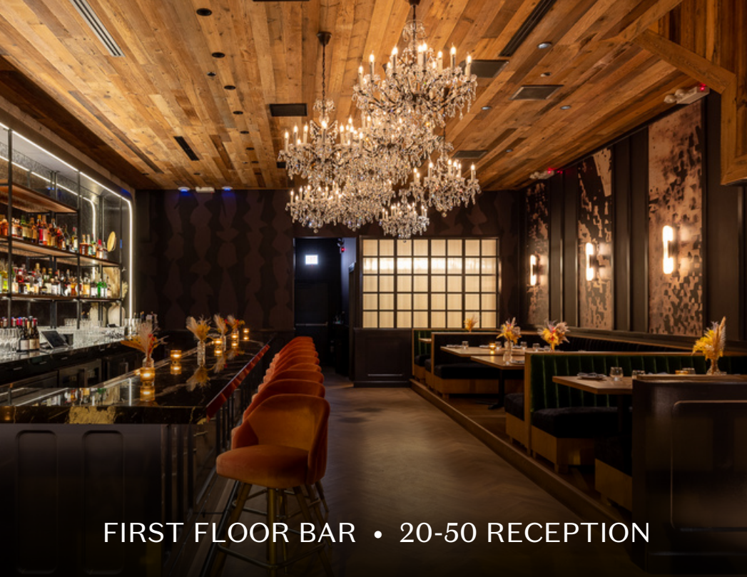
FIRST FLOOR BAR • 20-50 RECEPTION