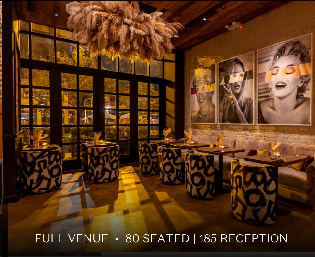
FULL VENUE • 80 SEATED | 185 RECEPTION