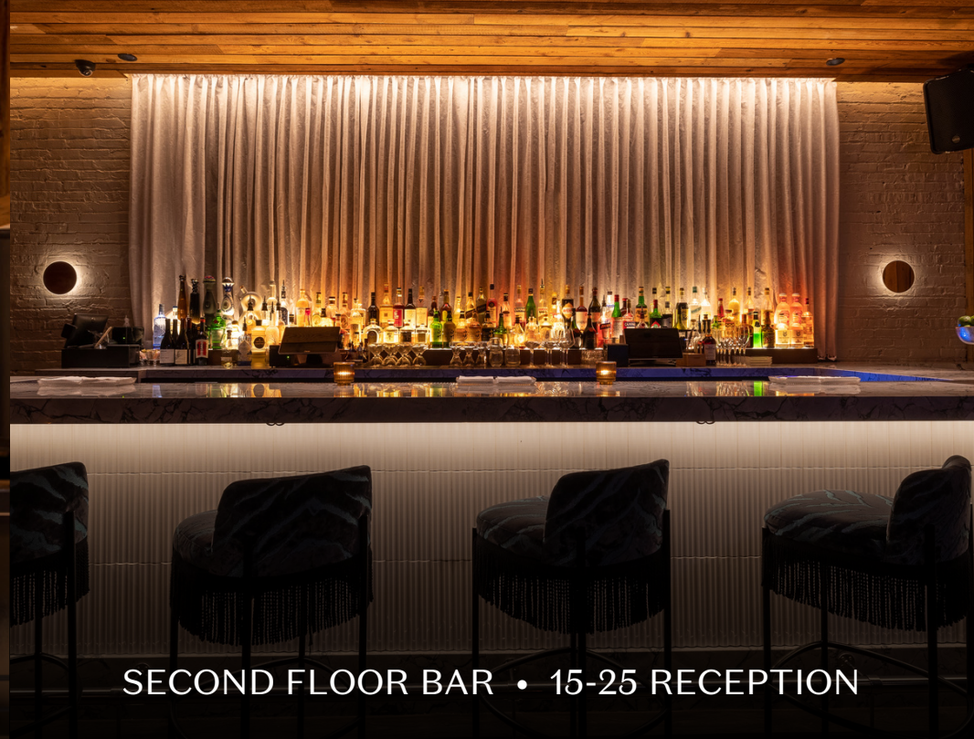
SECOND FLOOR BAR • 15-25 RECEPTION