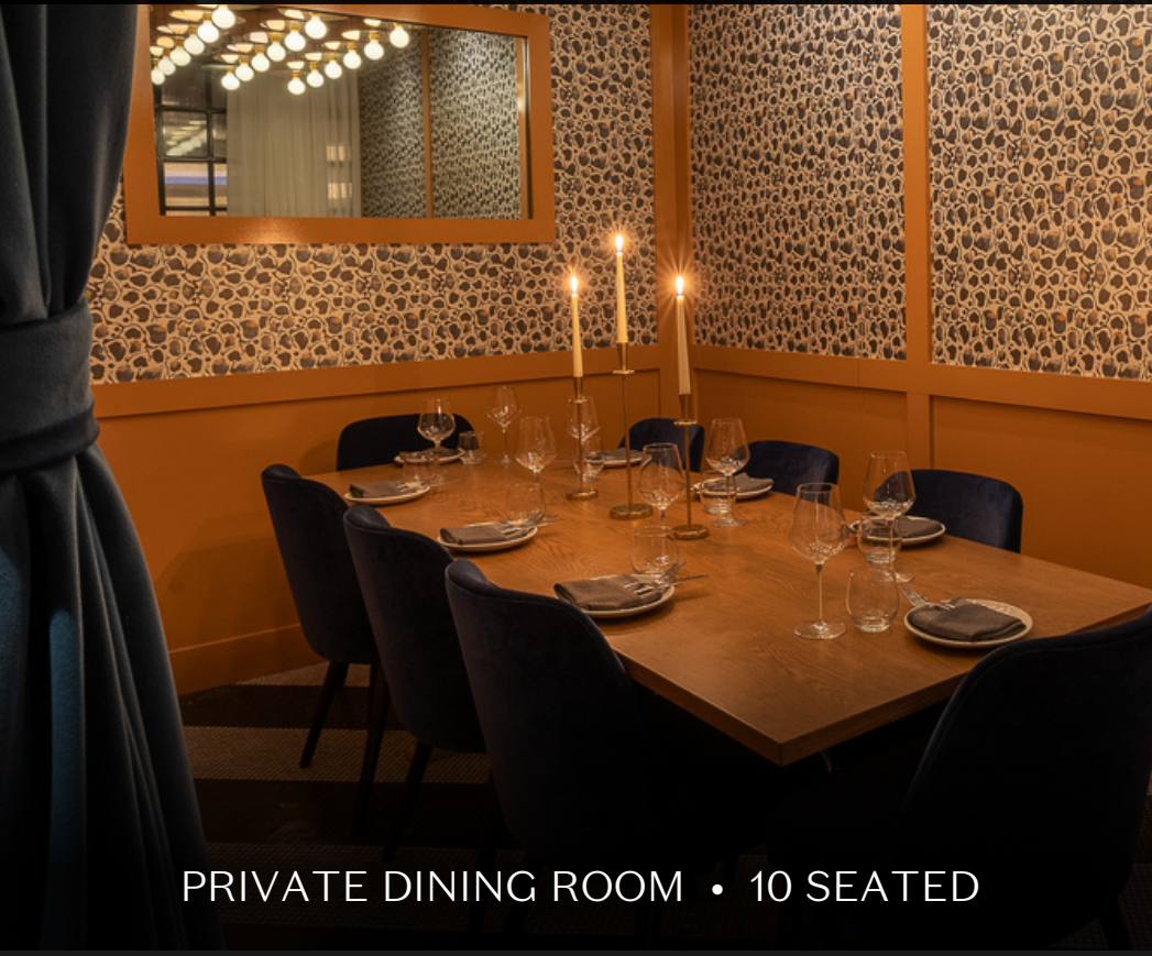
PRIVATE DINING ROOM • 10 SEATED