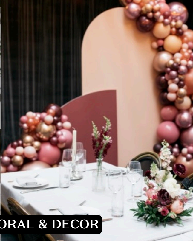
FLORAL & DECOR