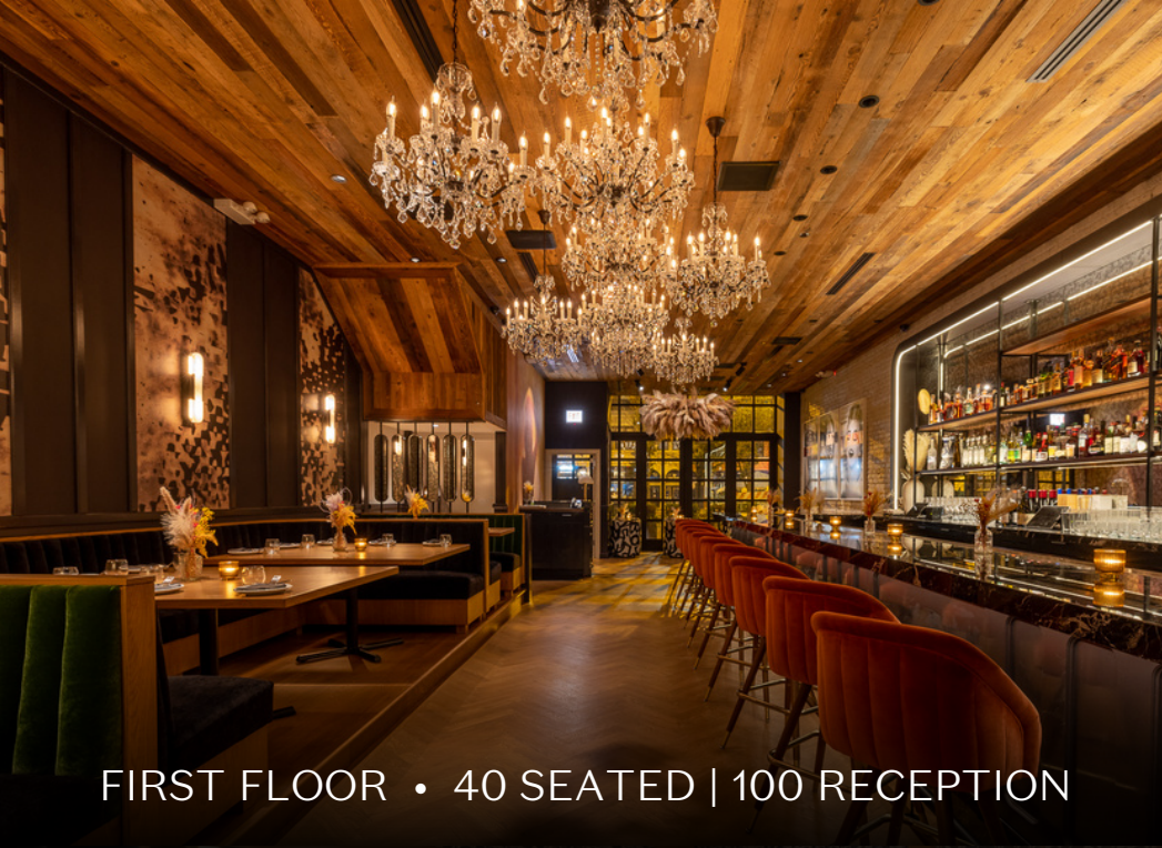
FIRST FLOOR • 40 SEATED | 100 RECEPTION