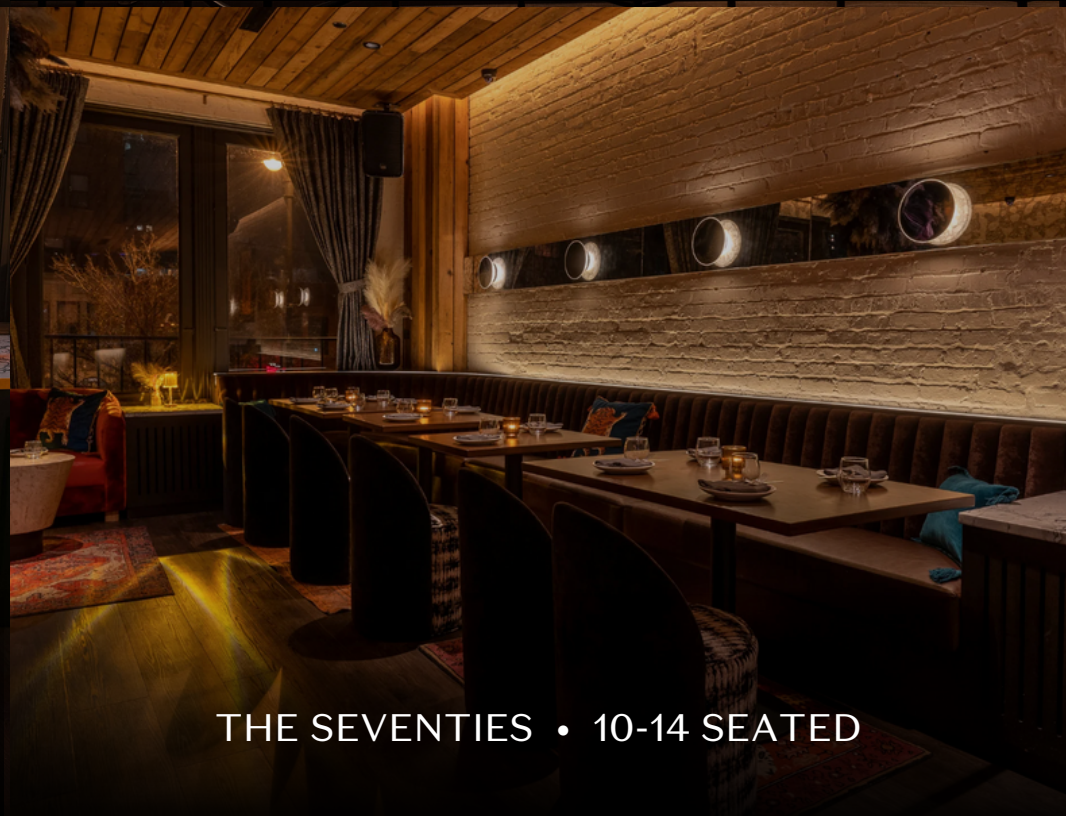
THE SEVENTIES • 10-14 SEATED