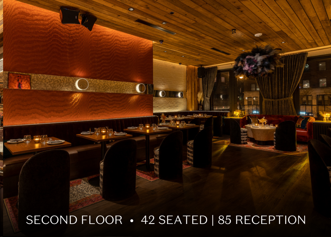
SECOND FLOOR • 42 SEATED | 85 RECEPTION